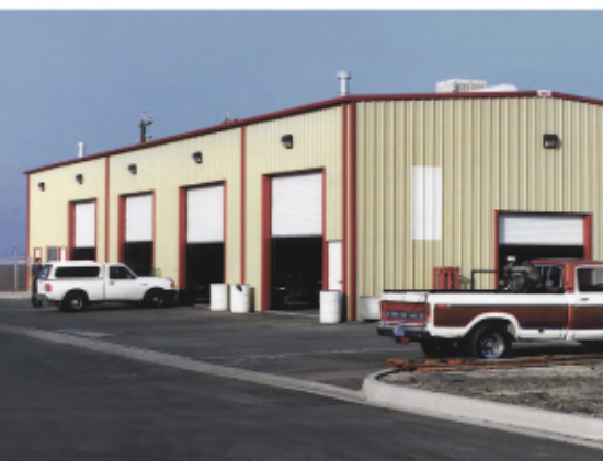
Commercial - Industrial