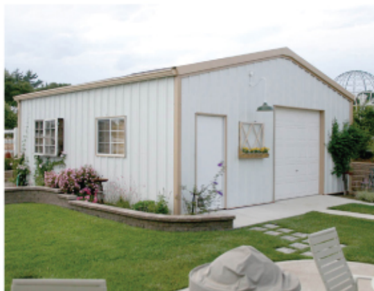
Workshops & Studios