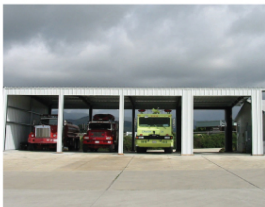
City - County - State